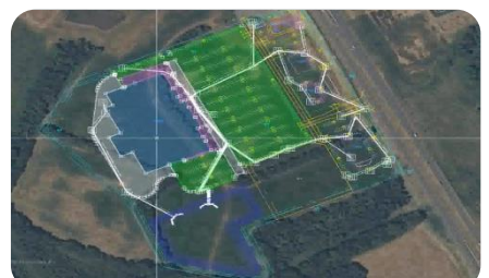
Produce Cost-Optimised Site Plans and takeoff budgets within hours

Date : 24 th February, 2014. Venue: Hotel Armada Petaling Jaya . Lot 6, Lorong Utara C, Section 52, 46200 Petaling Jaya, Selangor Darul Ehsan Malaysia. Tel : (603) 7954 6888 . Fax : (603) 7956 8088