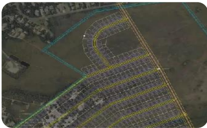
Create Residential Subdivision in Minutes