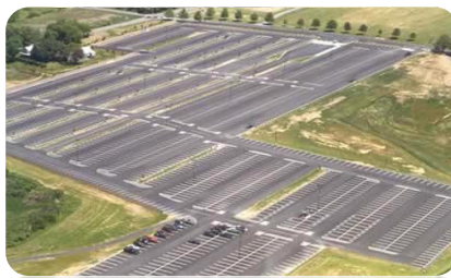
Create Parking Lots in Seconds